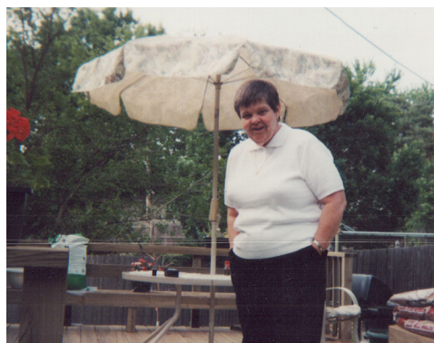
Georgia is all smiles after learning she is cancer free.